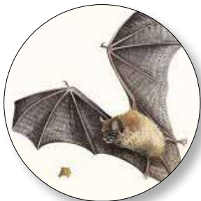
Spring Bat Walk

Since the last AGM we planned a busy programme of park events and managed to run a few of them but sadly, many had to be cancelled. Here are just a few that we lost: