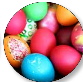
Inaugural Easter Egg Hunt

Undeterred , now that 'normality' is beginning to return, we will reprogramme some events.