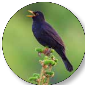
Dawn Chorus Walk