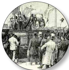
Chartist Anniversary Walk