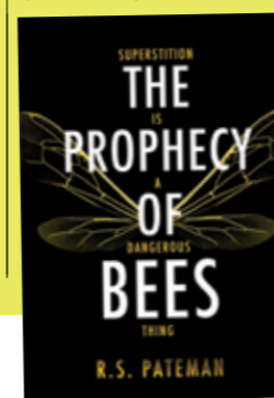
© Cover courtesy of Orion Books

The Prophecy of Bees is published by Orion.