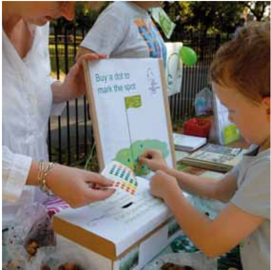
A young supporter marks the spot for bulb planting

‘You can make a park look clean and well presented, but if there’s no community involvement then there’s nobody there to help reach or maintain that standard, or take the park in the directions it must go to meet the needs of those who use it.’