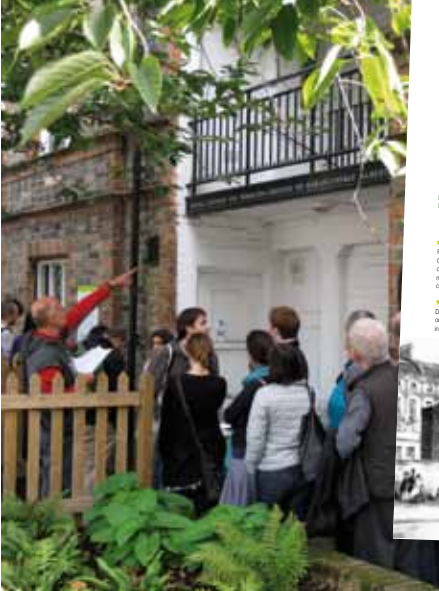
Welcome home: Open House visitors take a tour of the Lodge

The Lodge hasn't been open to the public since it first moved to Kennington Park from the Great Exhibition in 1852. It has