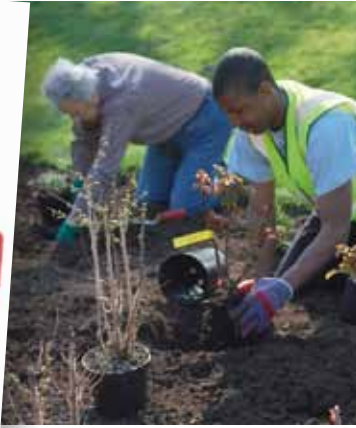
Bloomin' lovely – the flower beds get a new lease of life