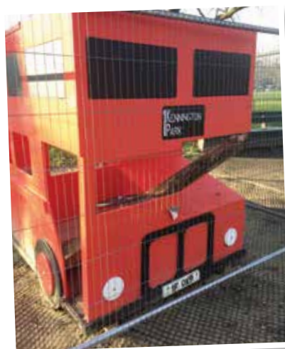
The beloved playground bus (Mk 2), fenced off and out of bounds again after it was vandalised between Christmas and New Year. But thanks to quick work by Lambeth's maintenance team, it was soon back on the road

All in all, it's been quite a wait! But we think the wait has been worth it.