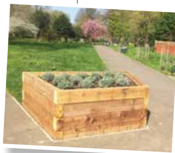
The new raised bed (right) on the Green Link, planted with lavender. Built by Bee Urban supported by DASL, it will allow disabled people to get closer to nature